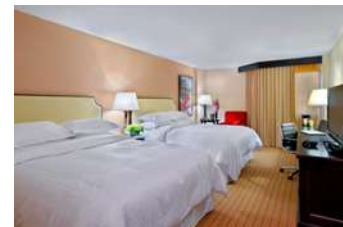
(Sleeping Room view)